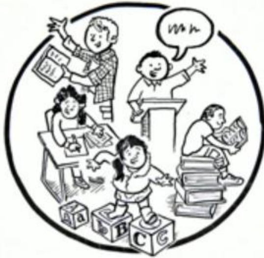
ENGLISH LANGUAGE ARTS